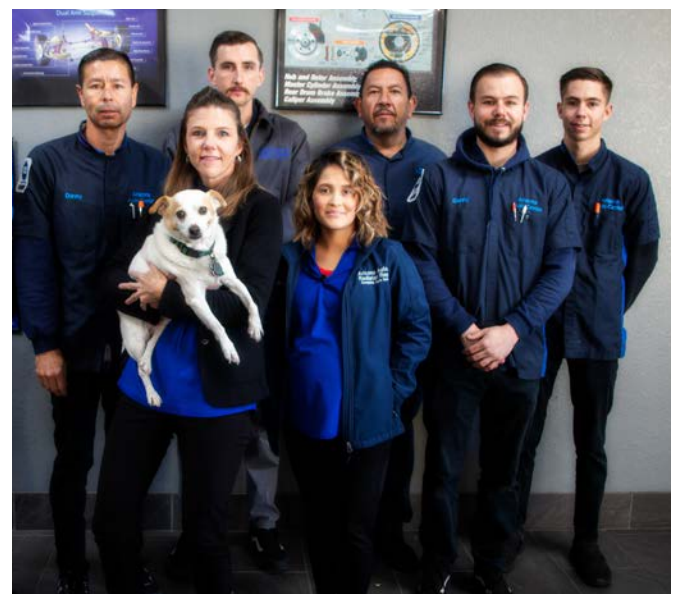
Brought to you by the Arizona Auto Team